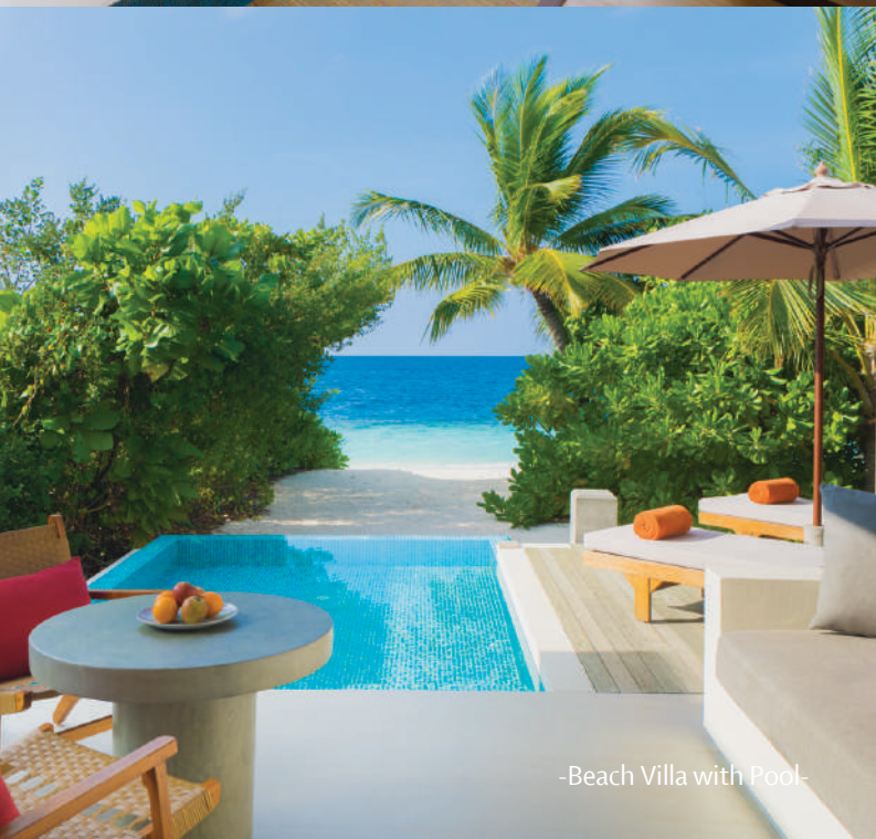
-Beach Villa with Pool-