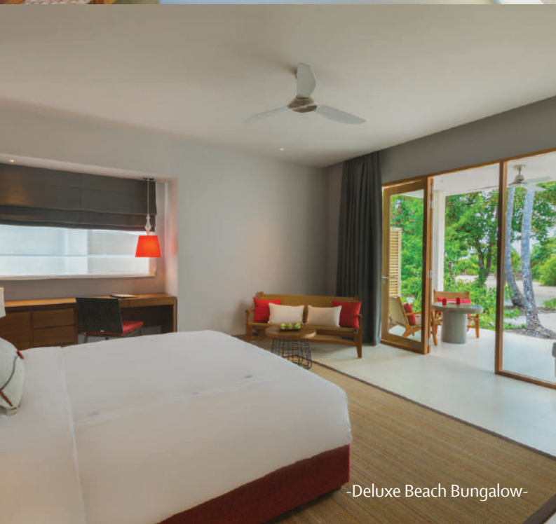
-Deluxe Beach Bungalow-